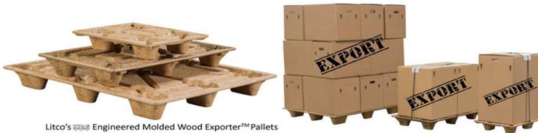
Litco's Engineered Molded Wood Exporter™ Pallets